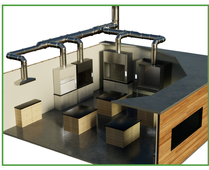
Example layout shown with AMPCO ventilation.