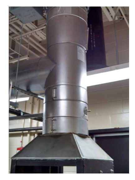
Laboratory fume hood applications shown with AMPCO factory-built double wall and single wall venting.